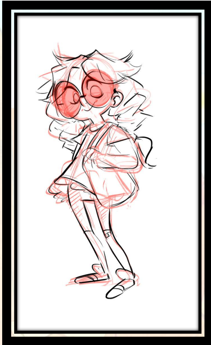
REBECCA DOOM Days