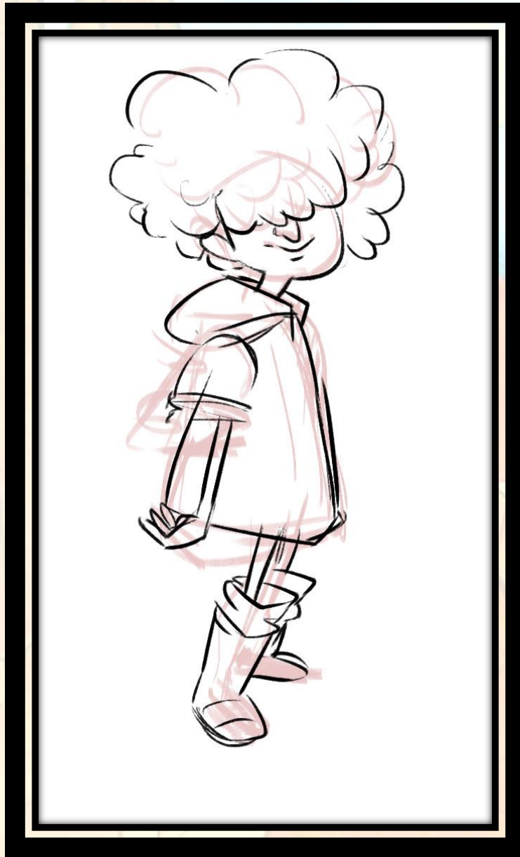
CHEESE PUFF CHRIS