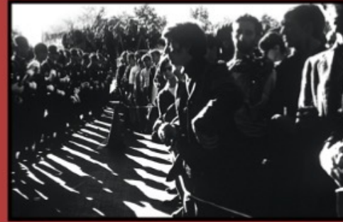
Kindly talking to soldiers