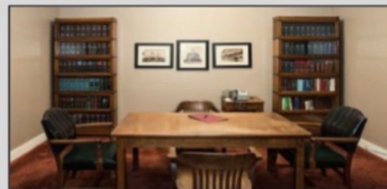
University of Maryland (9 scenes)