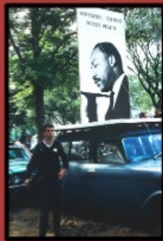
At the Poor People's Campaign