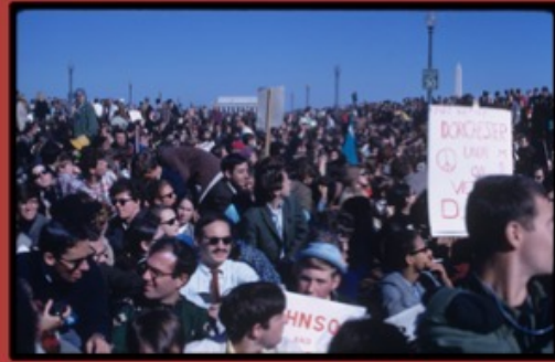
At the March on the Pentagon