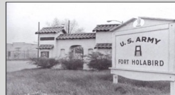
Charlie's law office (6 scenes)