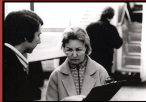
With a skeptical draft board clerk