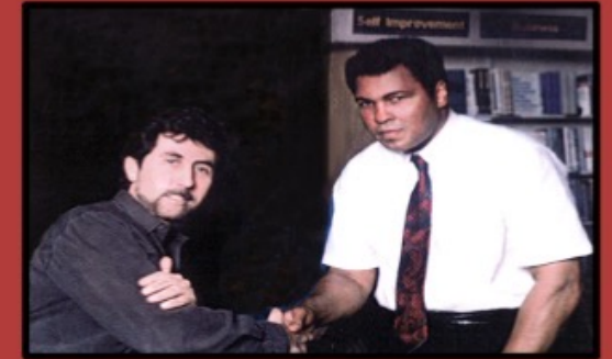
With fellow CO, Muhammed Ali