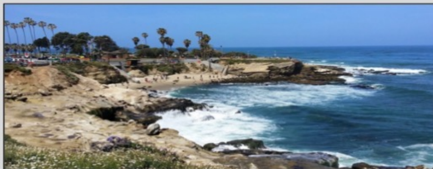
La Jolla (4 scenes)