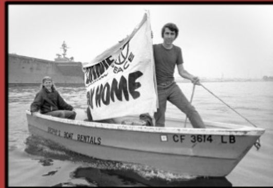
Motorboat Campaign to stop the USS Constellation from returning to Vietnam