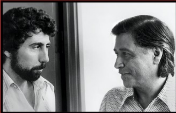
Consulting with Cesar Chavez