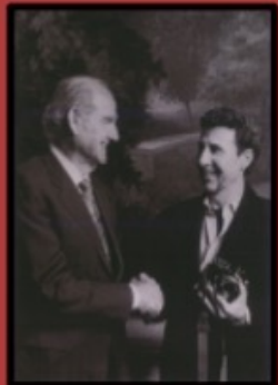
With Senator George McGovern